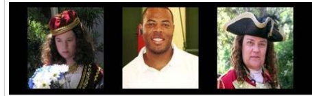
Greek Landing Day Celebration

Featured Photos - 9 total ( Expand View ) next »