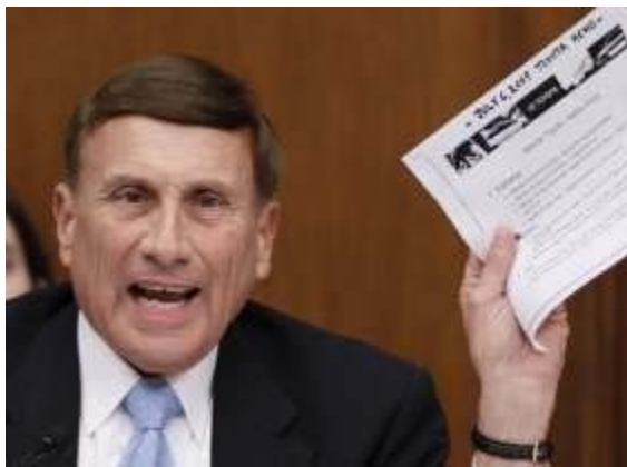
John Mica is chairman of the House Transportation Committee.