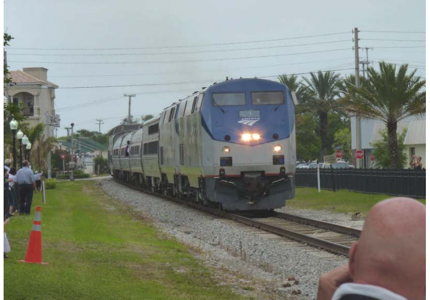
Above - Saturday's Amtrak Inspection Train arrives in Historic Downtown Stuart to cheering crowds and a brass band. Below - hundreds gather to welcome the Amtrak train into downtown Fort Pierce, with banners, signs, and cowboys mounted on horseback.

In coordination with the FEC, Amtrak ran an "Inspection Train" on the FEC Corridor from Miami to Jacksonville, with stops in West Palm Beach and each of the eight future station cities (Stuart, Fort Pierce, Vero Beach, Melbourne, Cocoa, Titusville, Daytona Beach, and St Augustine), with the train finalizing its run in Jacksonville.