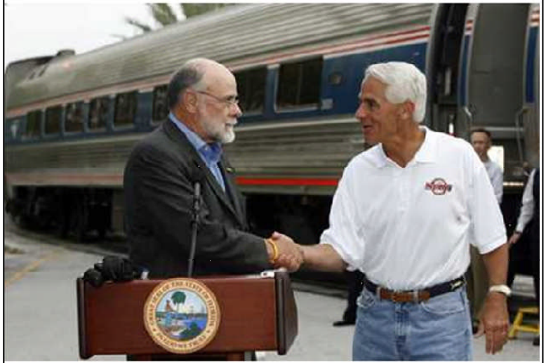
Governor Charlie Crist greets Thomas Carper, Amtrak board chairman. A special train ran from Miami to Jacksonville along the east coast to check the feasibility of resuming passenger service between the two cities. “We see tremendous growth opportunities here,” said Carper.

Declaring that “it just makes sense,” Gov. Charlie Crist endorsed efforts to bring Amtrak passenger rail service to the Florida East Coast rail line Saturday morning. (Jacksonville.com, 5/1/2010)