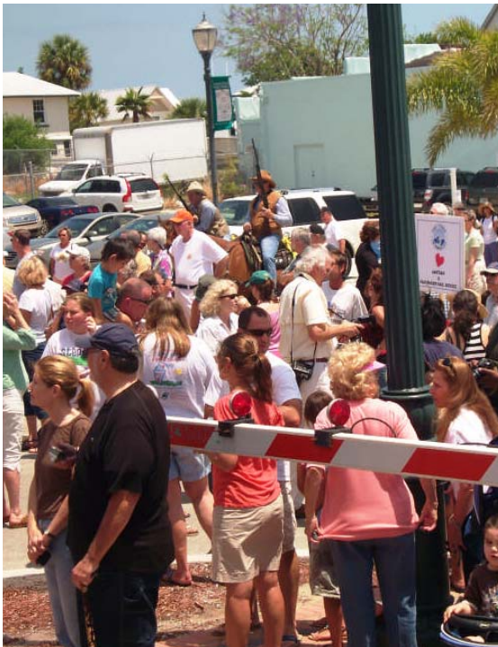
Top left - Amtrak train enters West Palm Beach. Bottom left - cowboys on horseback mix with large crowds greet Amtrak in Fort Pierce. Top right - enthusiasm abounds in Vero Beach. Bottom right - US Congresswoman Suzanne Kosmas boarding the train in Titusville along with local city officials.