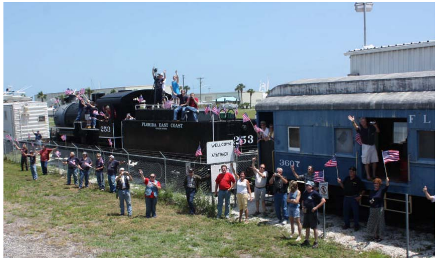
Above - a long-time project advocate welcomes Amtrak to Vero Beach. Below - crowds gathered north of Fort Pierce at the Fort Pierce railway.

The May 1st Amtrak Inspection Train illustrated "the art of the possible" for advocates of the project, many of whom have been working on the project for more than a decade. All of the communities are engaged side-by-side with FDOT and Amtrak as a revised application for project funding is prepared to submit this summer for the next round of High Speed/Intercity Passenger Rail program (deadline anticipated July 2010). More photos from the Inspection Train as well as information on workshops in local communities, press related to the Inspection Train, and other project components are available at www.tcrpc.org .