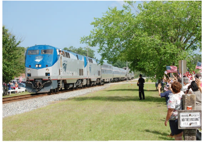
Titus Spoke Bunnell.

Above left and above right - grand rally in the City of Bunnell with a hundred-plus American flags and banners welcoming the Inspection Train with a specific request: "Amtrak - Please Stop Here!"