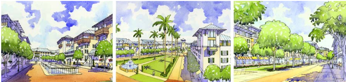
Village Green Mall Redevelopment - City of Port St. Lucie

TCRPC staff participated in the quarterly meetings of the Florida LEPC Chairs/Staff Coordination and State Emergency Response Commission (SERC). These groups determined State and local policies and administrative direction on issues such as hazardous materials regulations, emergency planning and response guidelines, emergency responder training, public awareness, hazardous materials release notification and cleanup procedures, federal emergency planning and training grants, and LEPC policies. TCRPC continues to be represented on the SERC Hazardous Materials Training Task Force, charged to implement statewide standards for mandatory public and private sector hazardous materials emergency first responder training. TCRPC staff also serves on the SERC Regional Hazardous Materials Response Team workgroup.