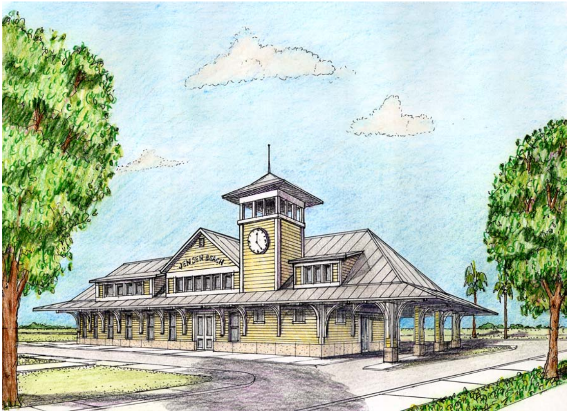
Jensen Beach Train Station – Martin County