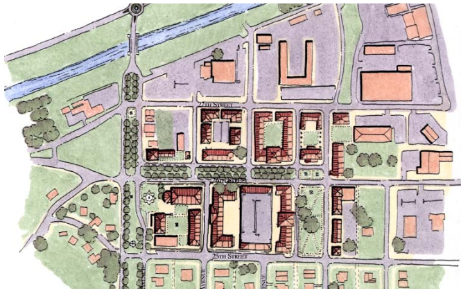
Administration Building Expansion – Indian River County