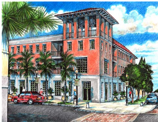
Civitas Mixed-Use Building - City of Stuart

TCRPC reviewed thirteen (13) notifications of proposed change to a previously approved DRI. TCRPC reviewed thirteen (13) amended development orders issued by local governments for nine (9) different approved DRIs.