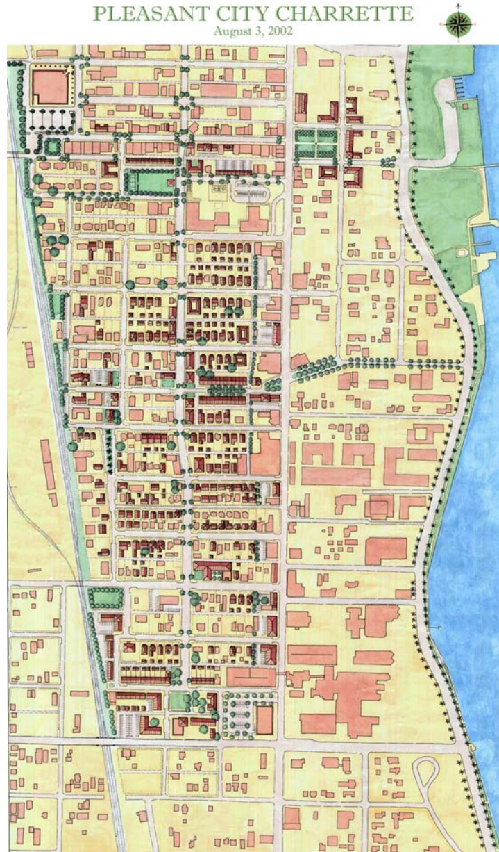
City of West Palm Beach

The following represents an Annual Report of Treasure Coast Regional Planning Council (TCRPC) activities to carry out its statutory responsibilities, contractual responsibilities to State and Federal agencies, and a summary of technical and other assistance provided to local governments, governmental and non-governmental agencies and private citizens of the Region. The period covered by this report is January 1, 2002 through December 31, 2002.