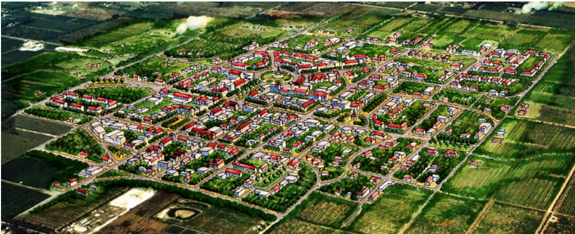
Alternative Pattern of Development for the Countryside Indian River County

The 28-member policy-making body of the TCRPC is comprised of a mix of elected officials of general-purpose local governments and private citizen representatives from within the Region. Member local governments are responsible for appointing two-thirds of the representatives, while the Governor of the State of Florida is responsible for appointing one-third. The TCRPC operates a diversified array of programs and planning functions related to the management of growth and development within the Region. These programs are staffed by professional and support personnel in various disciplines related to development and growth management.