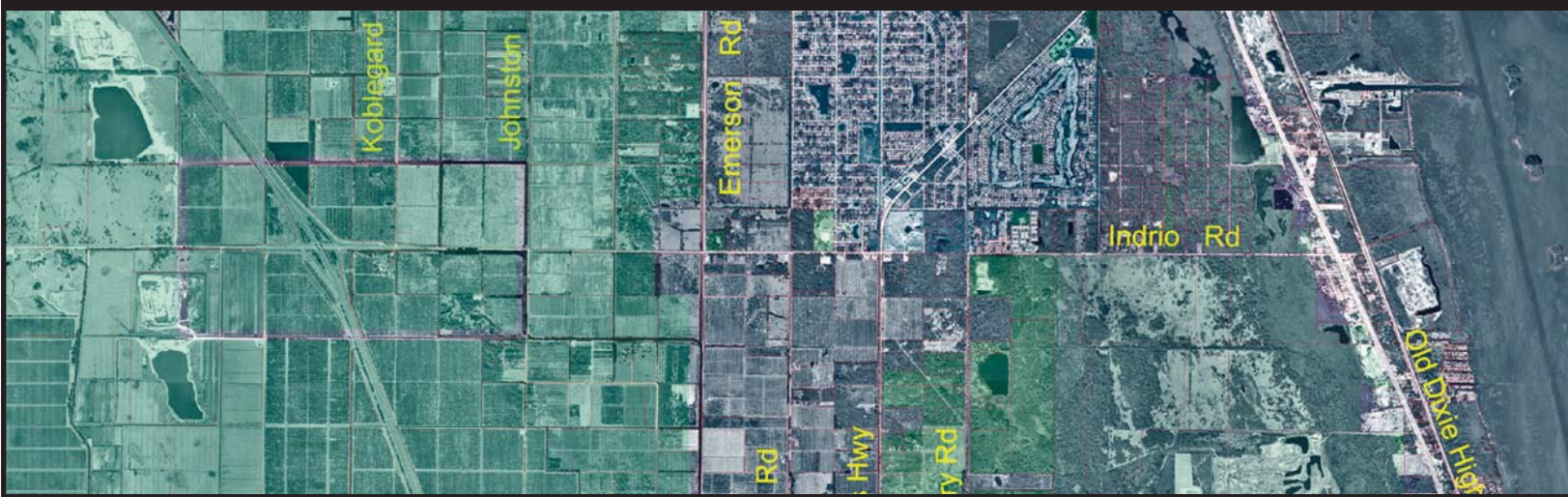
TODAY: Agriculture Zoning with Underlying Future Land Use of 1 du/ac - 15 du/ac / 41 million sf Commercial