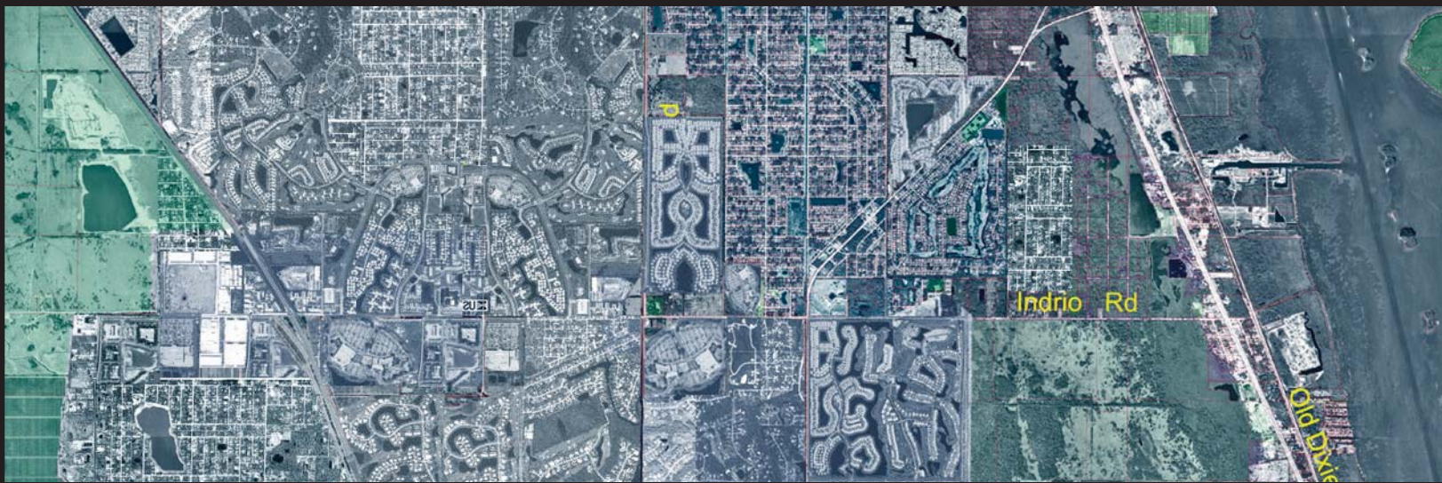
WITHOUT TVC: Anticipated Development Pattern under Current Comprehensive Plan