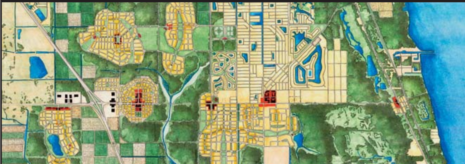
WITH TVC: Anticipated Development Pattern under Proposed Towns, Villages & Countryside Amendment