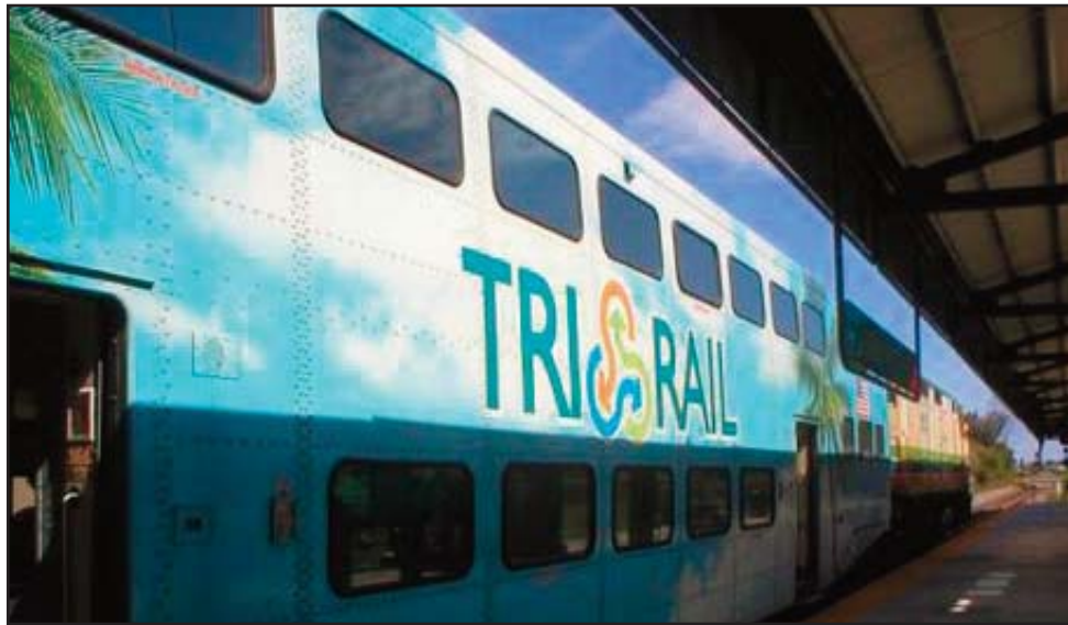
The Palm Beach Gardens Transit Oriented-Development (TOD) Charrette will explore options for a passenger rail station in the city along the FEC corridor. The charrette will also consider transit connections from the rail system to local destinations.

The City of Palm Beach Gardens and the Treasure Coast Regional Planning Council (TCRPC) invite all interested residents, property owners and business owners to participate in a public design charrette to create a vision for the future of passenger transit on the Florida East Coast Railroad corridor (FEC) in Palm Beach Gardens.