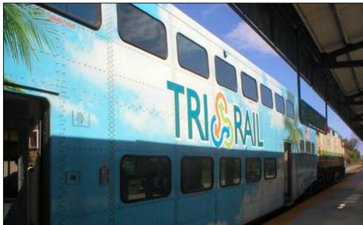
The Lake Worth TOD Charrette will explore redevelopment opportunities in downtown Lake Worth as it relates to the FEC and Tri-Rail service corridors. The charrette will also look at downtown retailing issues and a Lake Worth Park of Commerce update.