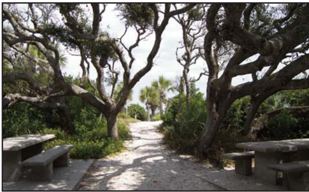
Well-planned transportation options are vital to a high quality of life