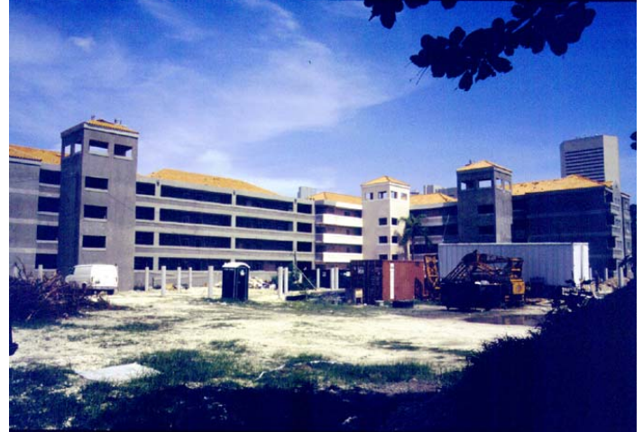
Mizner Park in Boca Raton under construction