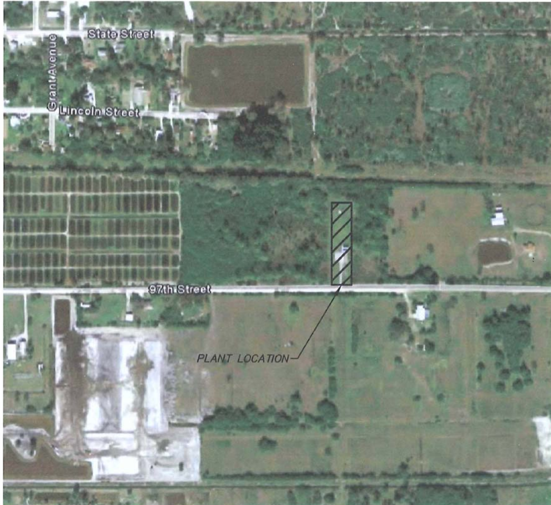
EXHIBIT 'C' (AERIAL MAP)