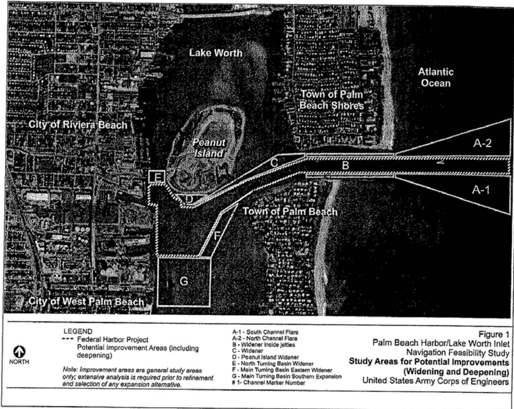
Figure 1. Expansion Alternatives Proposed for Lake Worth Inlet (Palm Beach Harbor)